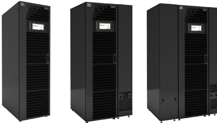
Up to 100kW 208V

The flexible, scalable, redundant design of the Liebert® eXM™ UPS is available in many system configurations to ensure optimal power protection.