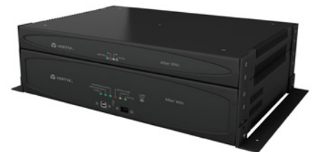
Albér BDSUi Battery Monitor